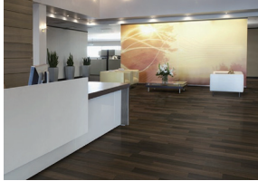
Luxury Vinyl Tiles

Or alternately you can opt to go with Luxury Vinyl Tiles for an even lower-cost solution, achieving a similar look.